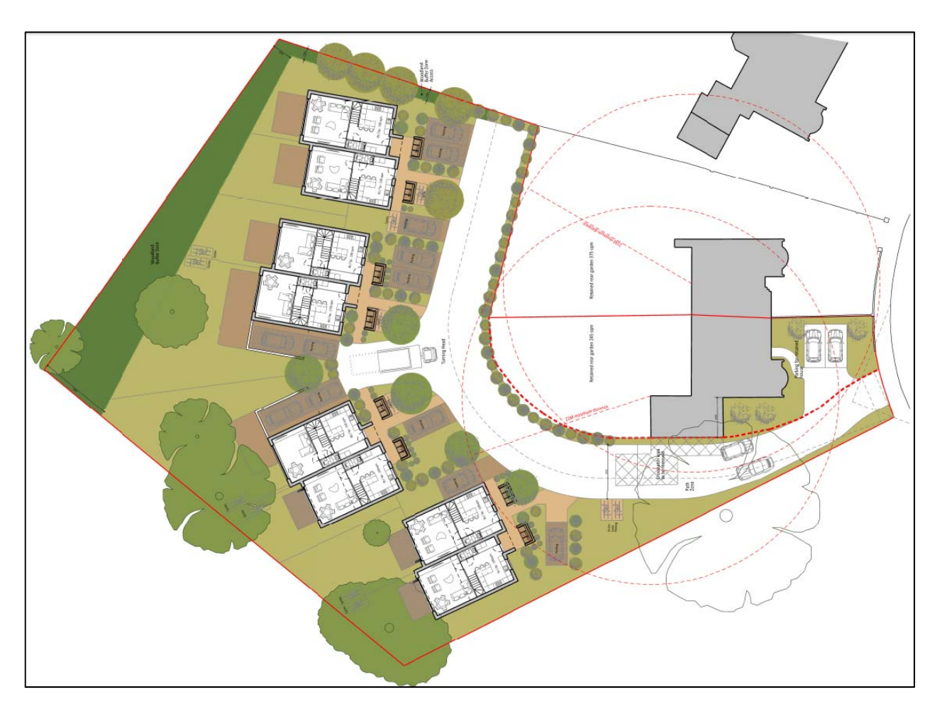
Figure 3-Proposed Site Plan

8.23 The development offers generous separation distances to the existing buildings on Wattendon Road, and the proposed built form would comprise of blocks that are broken up in form to respect the existing development pattern in terms of the separation distance between buildings. The breaking up of the massing to the built form also assists in achieving a level of acceptable subservience given that this would ensure that the existing suburban character of the area would be retained.